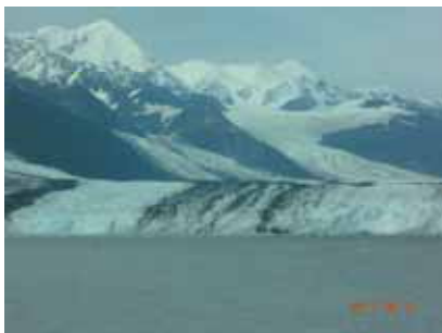
Mountain and Glacier