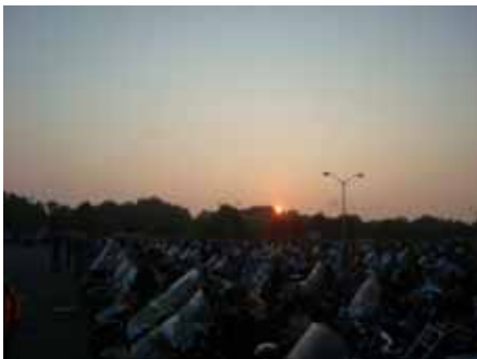
Photo: Pentagon sunrise 9-11 ride