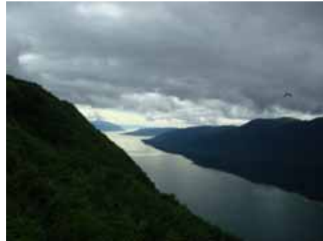
Photo: Mountain top in Juneau AK

Planes, trains, and automobiles covers just some modes of transportation we took during our trip. We spent the night in Vancouver before our scheduled departure on the Princess cruise line "Diamond Princess". Our port visits included Ketichikan, Juneau, and Skagway. We cruised thru Glacier Bay, and College Fjord before disembarking in Whittier.