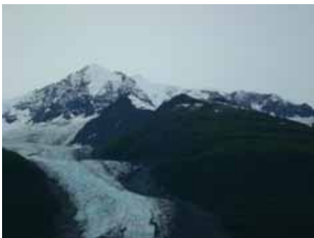
Photo: College Fjord Glacier

Planes, trains, and automobiles covers just some modes of transportation we took during our trip. We spent the night in Vancouver before our scheduled departure on the Princess cruise line "Diamond Princess". Our port visits included Ketichikan, Juneau, and Skagway. We cruised thru Glacier Bay, and College Fjord before disembarking in Whittier.