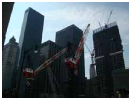
Photo: Freedom towers skyline almost completed

Overall, it was a difficult ride with over 2,000 bikes and different riding skills but we all made it to NYC. Sunday morning, we all gathered for the ride and ceremony at ground zero. Afterwards, the different groups departed for home in an attempt to beat the coming storms. We're happy to report all riders returned home safe.