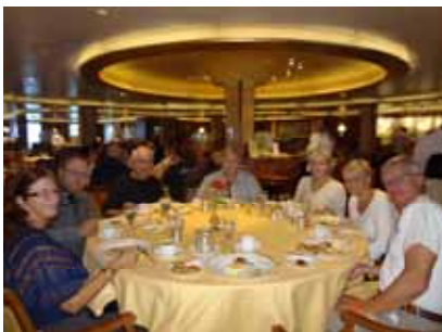
Formal Dining Room on Ship