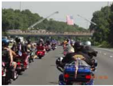
Overpasses were often crowded with people and flags