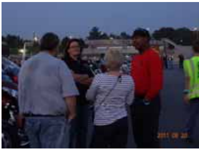
Early morning at Pentagon awaiting instructions to take off