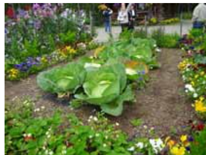
Look at the huge cabbage And beautiful flowers!