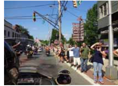
Much cheering and fanfare from Smalltown America

So, how did everyone survive the earthquake? It scared me – I have never been in an earthquake before. Scared my cat too – she came tearing through the house. I am now sitting here typing this article with a hurricane raging outside – good grief! Mother Nature needs to cut us a little slack here. Hopefully, September and October will bring us some nice riding weather. I am anxious to get out on a few more group rides with my Spyder.